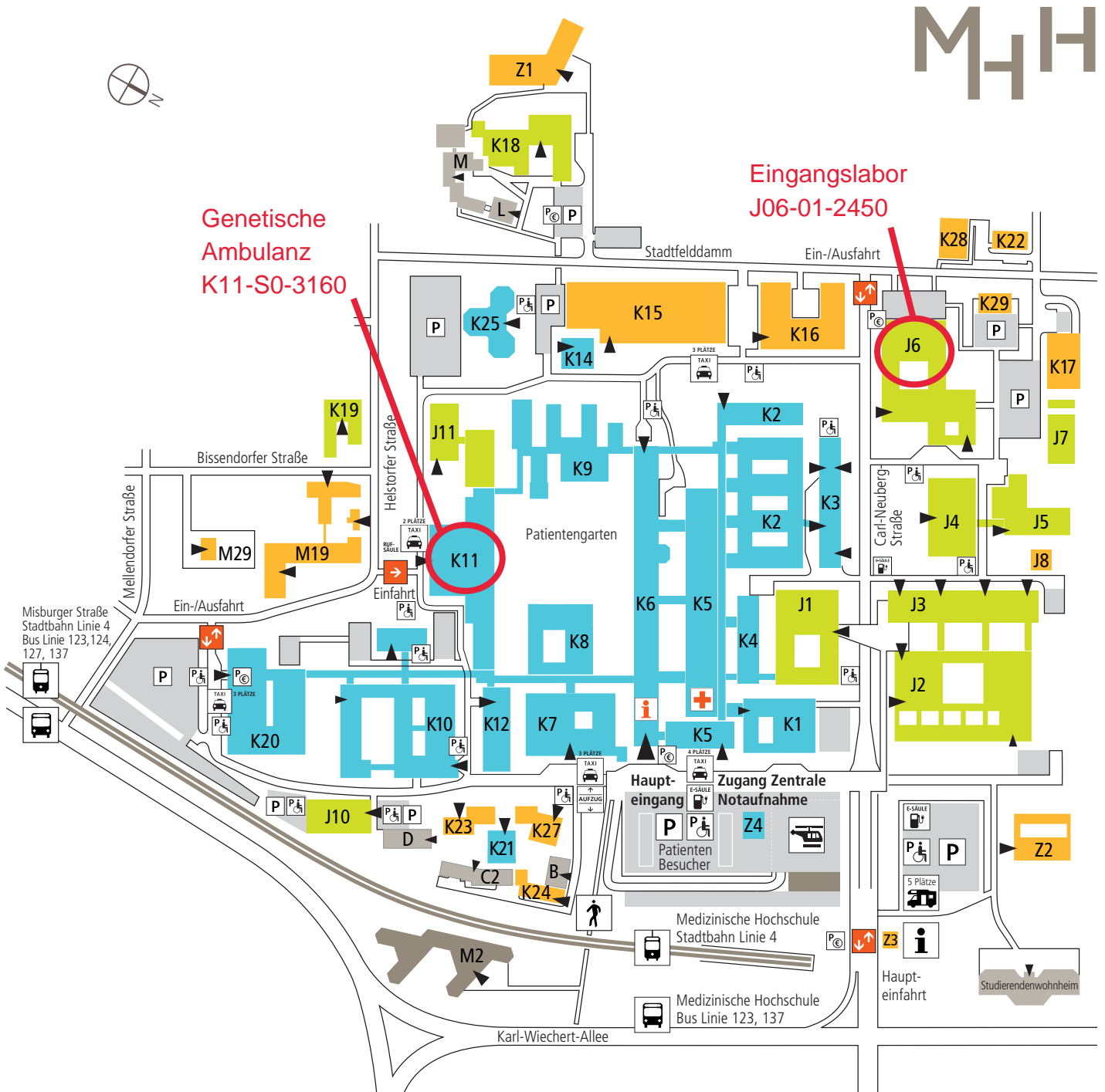
Genetische Ambulanz K11-S0-3160